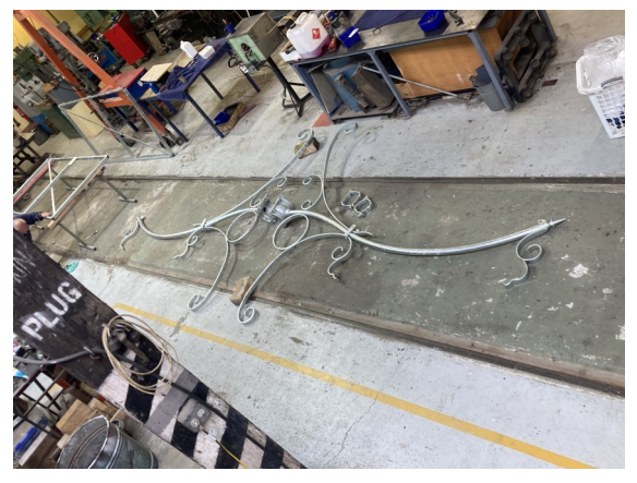
The newly constructed Bracket arm for the Village