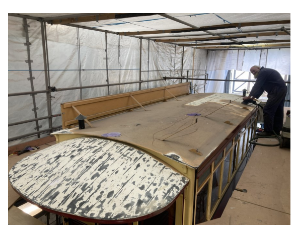
Mike Hobbs sanding the roof of 18.

Trailer 18 in the paint tent with the scaffold around it allowing access to the roof.