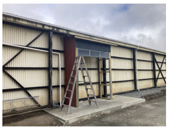
The new Sawdust extractor room beside TBI