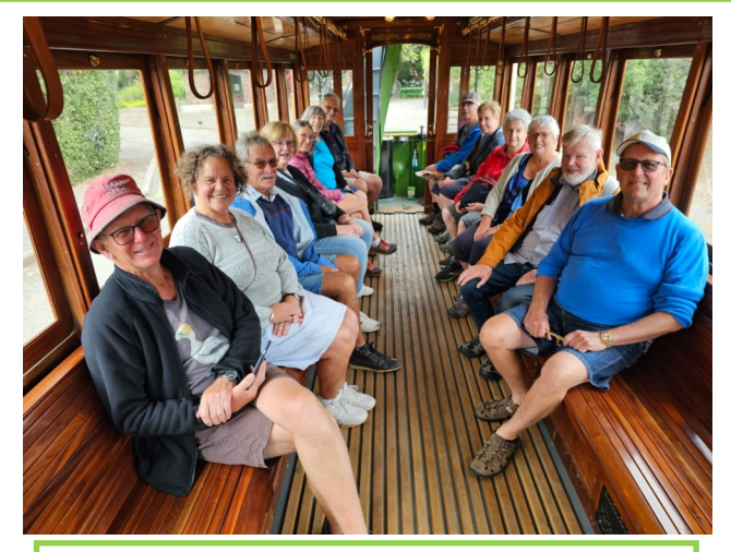
The group onboard DD26