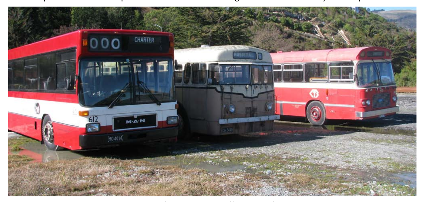
Buses on the move—Hello Dunedin No. 1

As our contribution to the Anniversary celebrations, the THS will be running its trams and trolley-buses, and are also planning to have our ex-London double-decker bus, RT3132, in service pending the completion of Certification of Fitness Repairs. There are also plans to have a bookstall selling both THS and tramway-related publications.