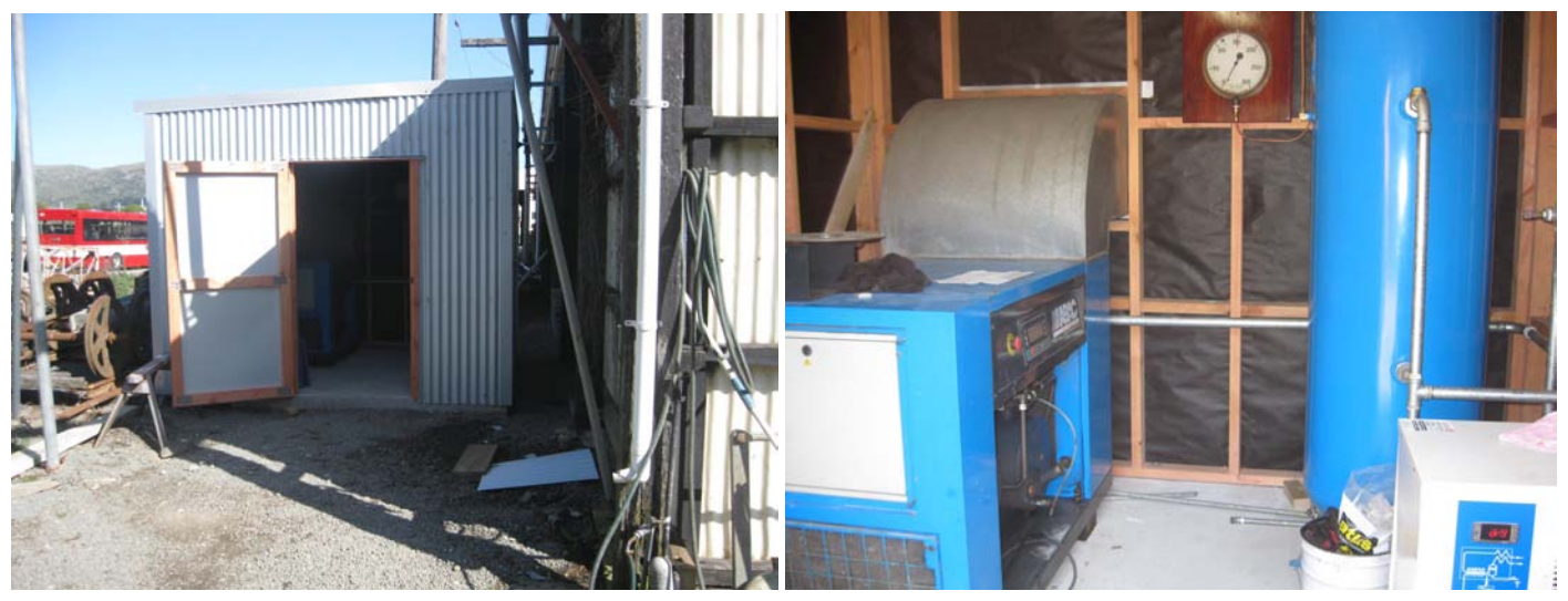
Murray Sanders reports on the construction of the new shed housing our 'new' compressor

Thanks to the inspiration, planning and supervision of Graeme Richardson, we now have a modern 22kW compressor installed with a surfeit of compressed air available for power tools and the spray paint tent. The compressor was purchased second-hand several months ago and to reduce the noise level, a small outbuilding has been constructed on a concrete slab, behind the main switchboard. So, the old noisy machine under the stairs will be redundant. There will be a remote start switch in the workshop. The new compressor will be used whenever air is required, since it needs to be run regularly.