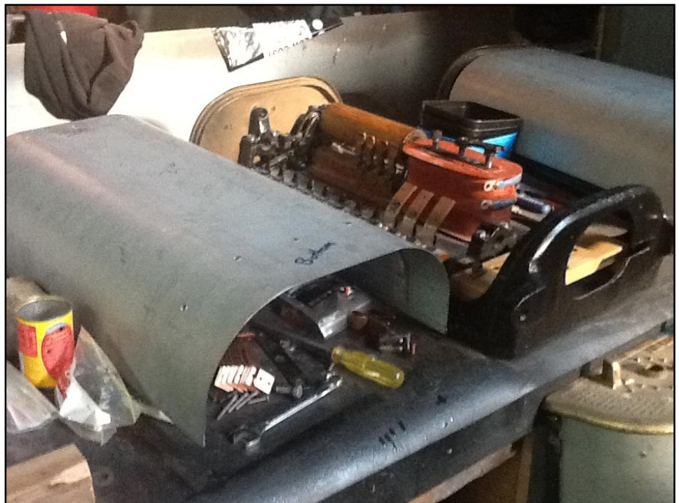
Top: controller after being stripped down, painted and reinstated (6 November).