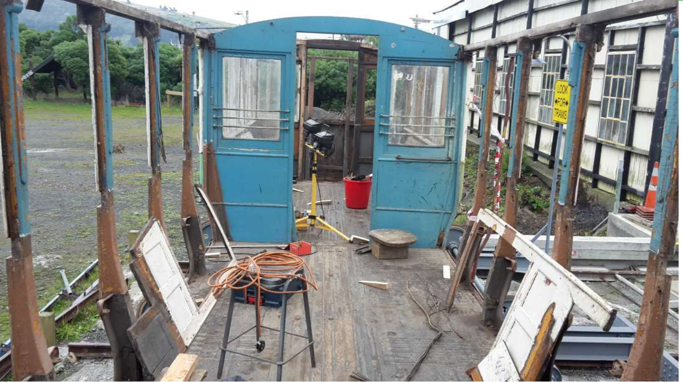
ABOVE: A different perspective on the ‘Yank’ with the roof off. The last time any tram of this type would have looked like this would have been back in 1904-05 when they were being reassembled in Christchurch after being made at the Stephenson factory in New York.