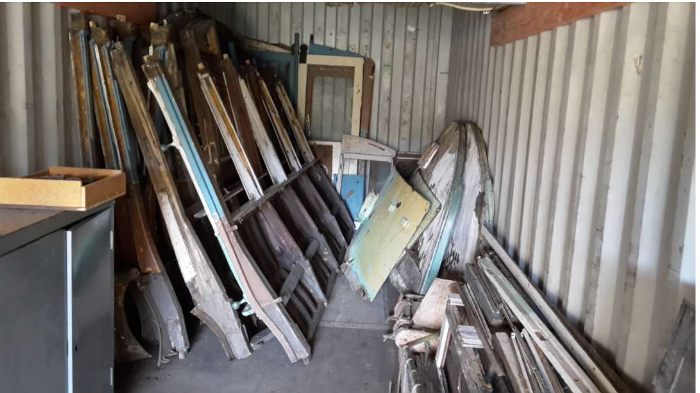
ABOVE: Looking very full, this is the majority of ‘Yank’ 12—now disassembled down to a ‘twelve inch to the foot’ kitset and tucked away in the STM’s container. The roof hangs above the assorted components below—the main parts still missing are the twin steel side chassis plates (photos of which will appear next issue), the low end platform (separated from the chassis) and the chassis itself, at this stage still being worked on.