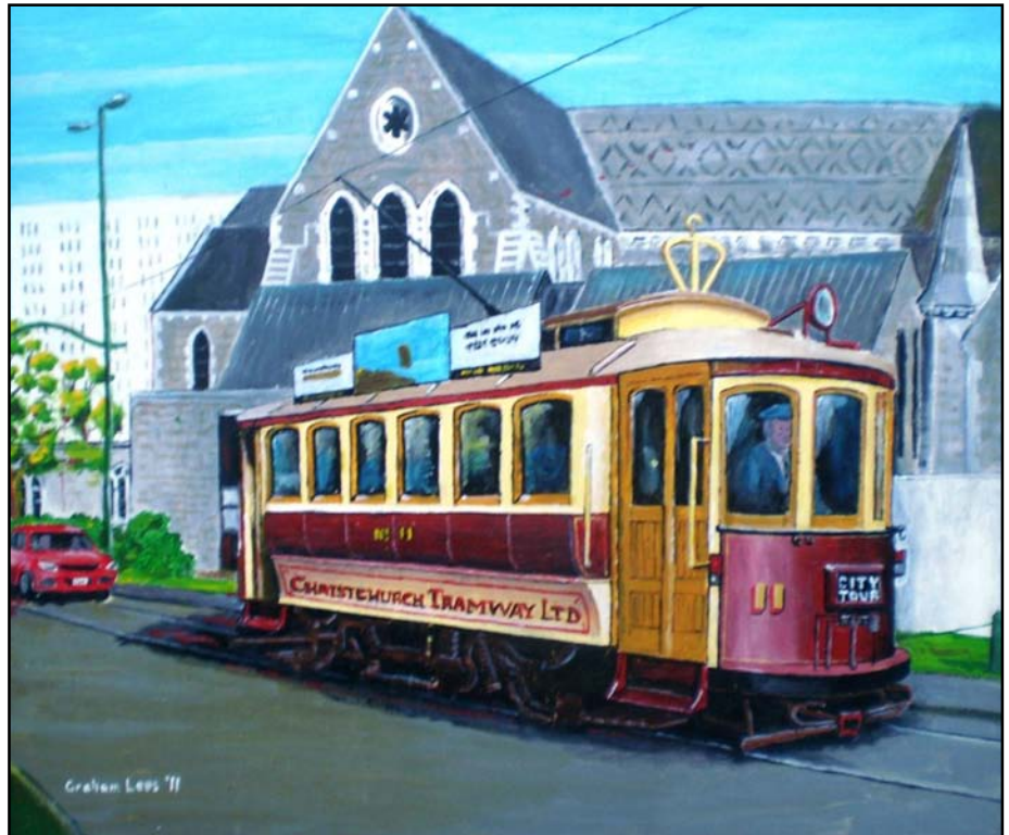
Dunedin No 11 passing Christchurch Cathedral, September 2010. 500 mm x 600 mm framed. $350

“To start with, you are most welcome to have this painting as it goes a little way towards saying thanks to the wonderful people of Christchurch who, immediately after the earthquake, assisted my son-in-law so kindly when he could not return to his hotel. He was in town for the medical conference and decided to walk to the airport with a colleague to see if they could get a flight back to Melbourne. On hearing the airport was closed, they tried to rent a car and someone gave them a lift to a rental shop who still had some vehicles. At