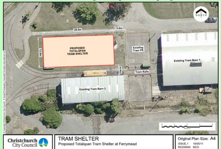
Aerial view of site of site of Tram Barn 3.

ones. Refer to the May Tram Tracts or the Society web page for further details and regular updates on progress.