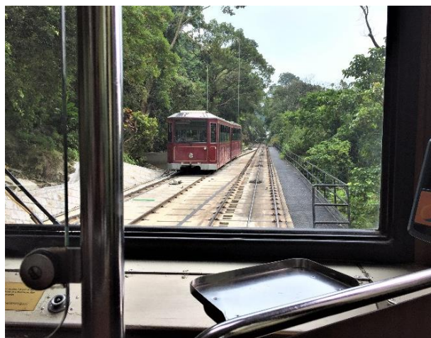
Peak Tram (funicular) Hong Kong