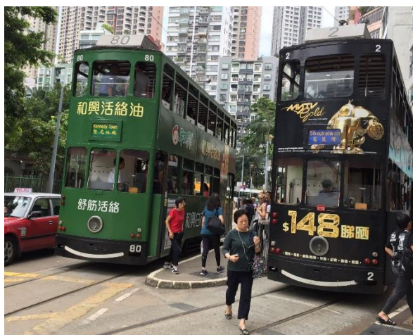
Happy Valley terminus Hong Kong