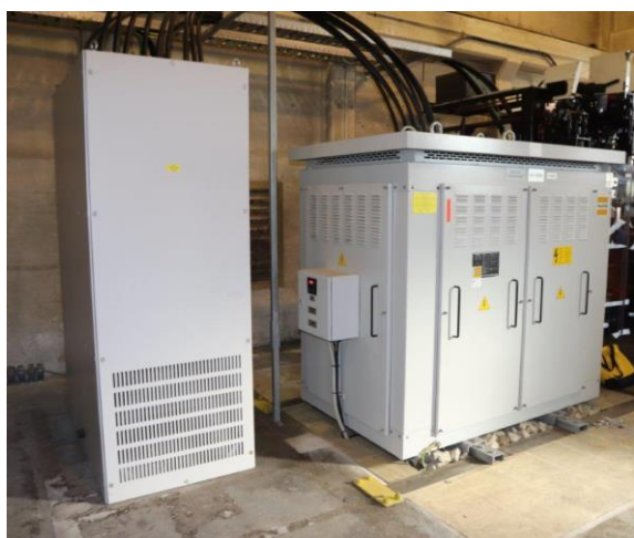
Below: Our new solid state rectifier and transformer prior to being removed from the Cable Car Lane substation, Wellington ( left) and the boxes of overhead fittings from the Wellington Tramway Museum which arrived in the container with the rectifier and transformer, as described on p. 4 above, and now moved into the trolley bus shed ( right).