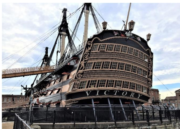
HMS Victory, Portsmouth – masts truncated for repair