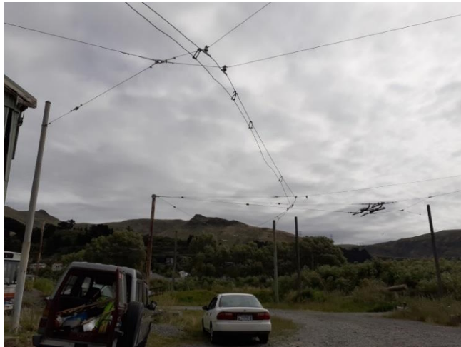
ABOVE: Two views of the recent trolley bus overhead reconfiguration at the Trolley Bus Shed, 07/12/19. The wires were transferred to temporary hooks at the correct height with the help of our Bedford tower wagon. The view at right shows the temporary support hooks in place and the overhead transferred over for the simplification works to commence.