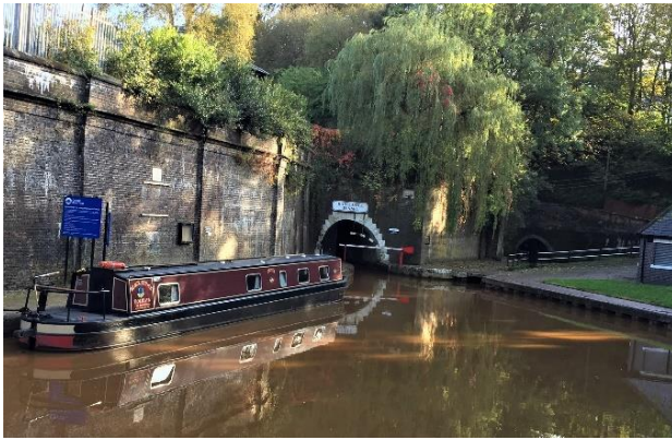
Overnight wait to pass through Harecastle Tunnel