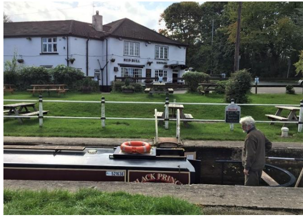
On the canal - negotiating locks and visiting canal side pubs