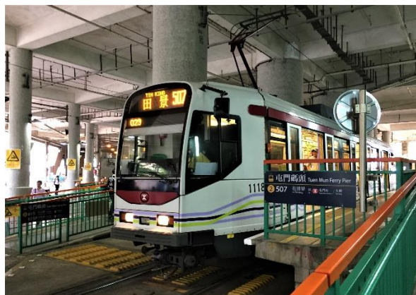
Tuen Mun Light Rail Hong Kong