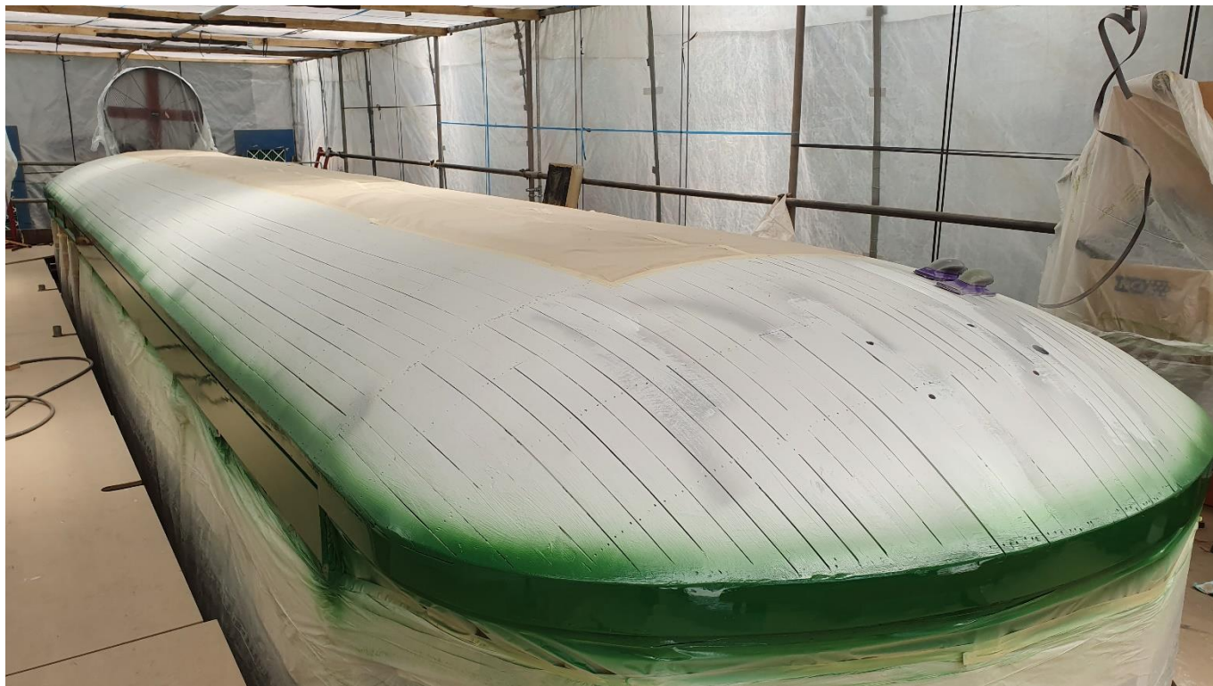
Above: Recent work on Christchurch 24 has seen the repairs to the roof completed (including filling in the large holes left by the latter day streamlined end destination boxes).