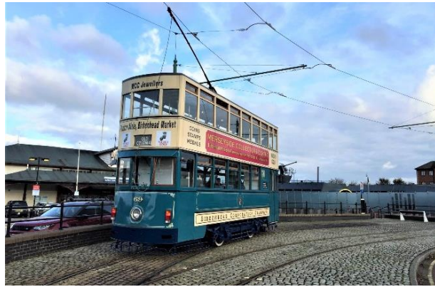
Wirral Tram – Merseyside Ferry Terminal